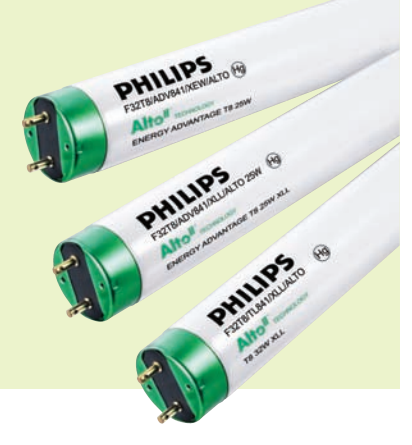
Philips T8 25W Extra Long Life Lamps featuring ALTO II™ Technology have a picogram per lumen-hour score of 20.

Exception: Screw-based, integral compact fluorescent Potential Technologies & Strategies lamps (CFLs) may be excluded from both the plan and the performance calculation if they comply with the Establish and follow a lamp-purchasing program that voluntary industry guidelines for a maximum mercury sets a minimum level of mercury content and life for all content published by the National Electrical Manufacturers mercury-containing lamp types. Work with suppliers to specify these requirements for all future purchases."5 Association (NEMA), as described in the LEED for Existing Buildings: Operation & Maintenance Reference 5) "LEED for Existing Buildings, Operations and Maintainance" January 2008, pgs. 51–52. https://www.usgbc.org/ShowFile.aspx?DocumentID=3617 Guide. Screw-based, integral CFLs that do not comply